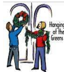
Hanging of the Greens Sunday Dec. 1st See Page 4

Pray for God to provide for our financial needs.