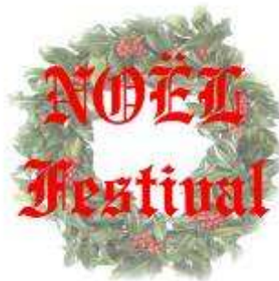
NOEL FESTIVAL Sunday, Dec. 15th at 6pm See Page 13