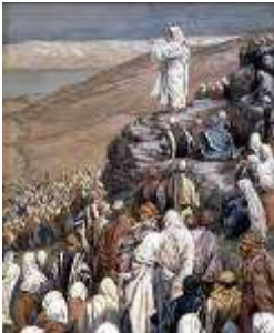
Sermon on the Mount Sermon Series Starting in January