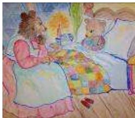
ADVENT Children in Worship See Page 4