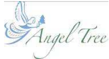
Touch of Hope Christmas Offering Angel Adoptions See Page 5