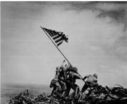
Raising the Flag on Iwo Jima , by Joe Rosenthal (Taken on February 23, 1945 during World War II)