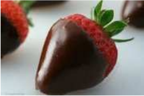
Women's Retreat - Sat. Nov. 12 th (page 3)