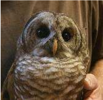
A wise visitor to the church. (page 13)