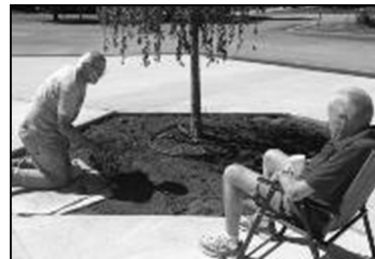
"Just a little more dirt to the left, please."