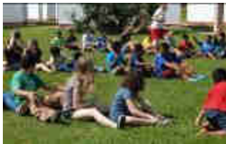
"Soccer Ball Pass-Back" game at ICA. Our kids mixed with the desert boys... priceless!