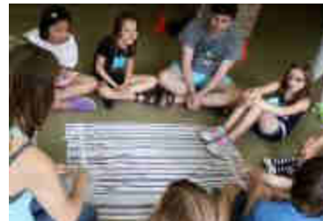
Fourth & Fifth graders at games.