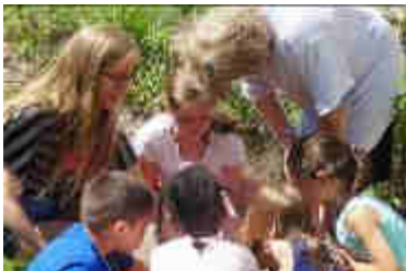
First graders at games.