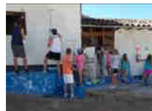
Our Group Peru '15 Team finally paints at Kusi, after days of sanding & scraping!