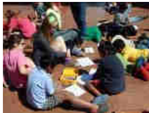
Art projects after our Bible Story presentation. Our girls work with the boys of ICA.