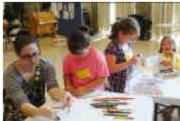
Second & Third graders at crafts.