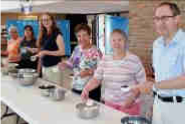
Trail mix for the journey.