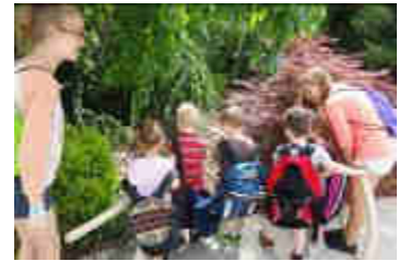
Preschoolers on an expedition; "We see a snake!"

At Everest, we learned His awesome power is enough to overcome any "mountain" or problem in our lives.