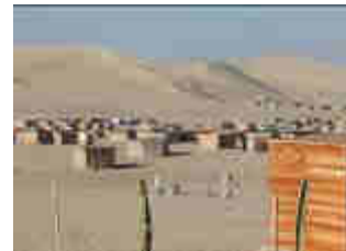
The desert shanty town outside ICA. Poverty beyond understanding!