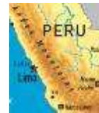
Peru Trip 2013