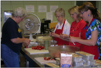
July 3 Picnic