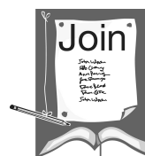
PW Bible Study!

Join us in this exciting new study beginning Thursday, September 8, 2011 (10:00-11:30a.m.) in the North Parlor. Study guides will be available at the first session.