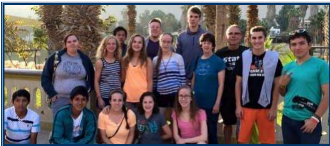
Our Peru Team arrives in Ica, Peru.