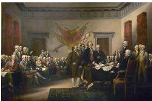
Declaration of Independence oil-on-canvas, by John Trumbull, 1817-19