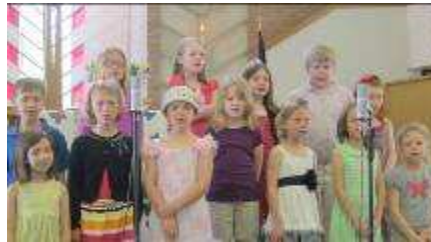
Mothers Day Service More photos- page 13

Sunday, June 15 th Special music in Worship ~Youth ~Children ~Dancers ~Praise Band ~Choir