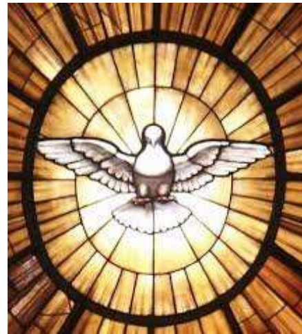
Bernini, Alabaster window from Cathedra Petri (1647-53), St. Peter's Basilica, Vatican