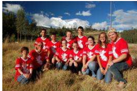
Peru Mission Trip- 2013 June 19 - July 2 See Page 7