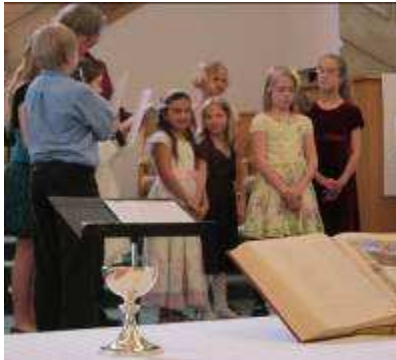
Mother's Day Celebration See Page 13