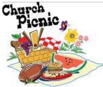
2nd Annual Summer Kick-off CHURCH PICNIC Sunday, June 30 th See Page 3