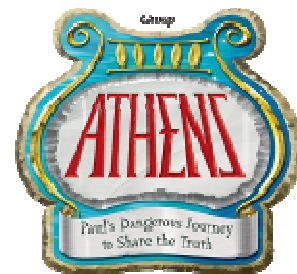
VACATION BIBLE SCHOOL Time Travel to Athens! Join the Adventure July 22-26 See page 3