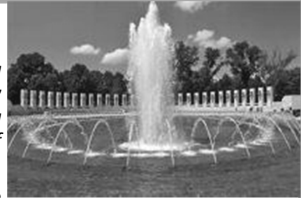
National World War II Memorial Washington D.C.