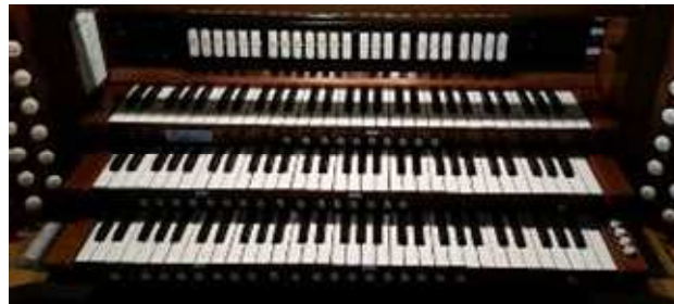
Our Console~ Aeolian-Skinner Organ, Op. 1427