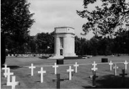
WWI Flanders Field American Cemetery; Waregem, Belgium