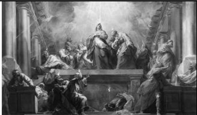
Jean II Restout, Pentecost , oil on canvas, 1732