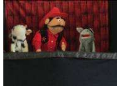
More Puppet Party Photos See page 4