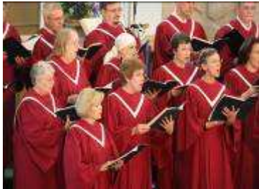
Requiem 2012 More photos - page 4

The First Presbyterian Church of Dearborn May 2012 Newsletter