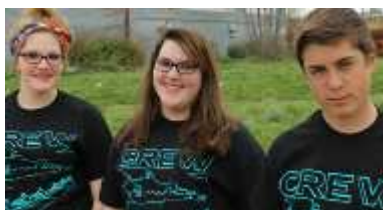
CREW & 4:12 "Telling their Story" See page 6