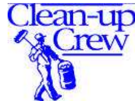
Saturday May 12th See page 10