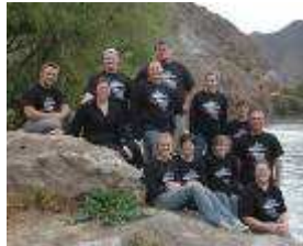
Peru Spaghetti Luncheon Sunday May 6th 11:00am Mitchell Hall