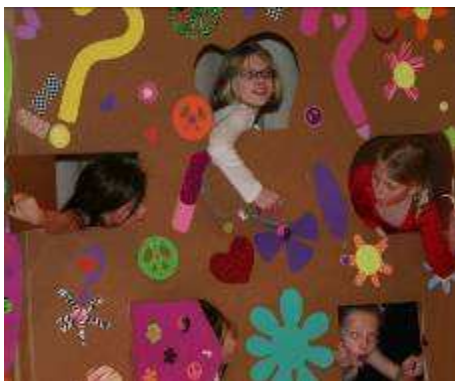
"The Joke Wall"