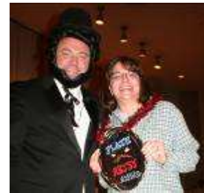
Most creative dessert!!!