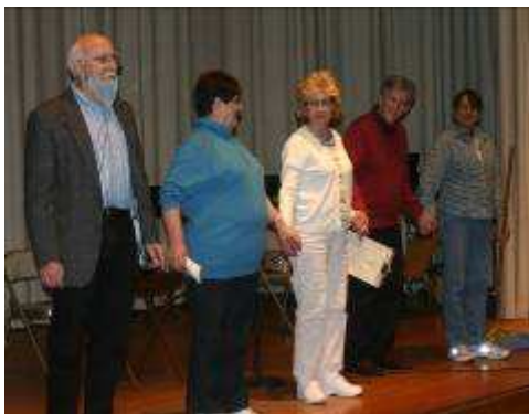
The Next Great Idea!