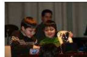
What's for lunch??