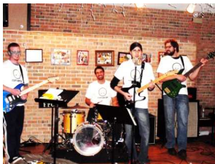
Young Adult Ministry & CONVERGE See page 7