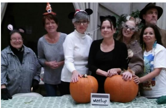
Nine members of SOAR came to share Trunk-or-treat at FPC